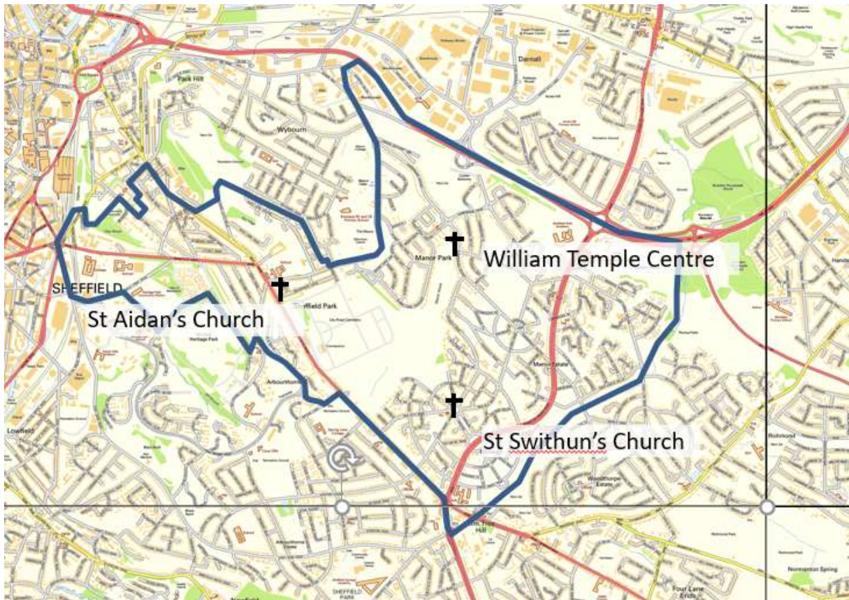
Figure 1 Map of the Parish Boundary with Church locations

As for the socio-economic picture, Manor Parish is at the heart of the Manor Castle Ward, described as a struggling estate with high urban adversity and over 40% living in difficult circumstances and high levels of hardship, mainly among the younger population.