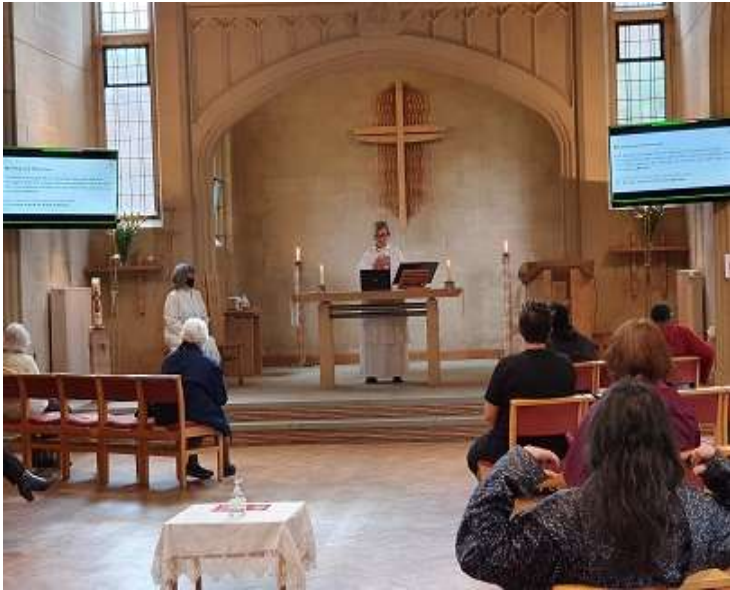
Figure 7 Inside the church showing two of the three screens used for the services and events

St Aidan’s is a very mixed Anglican congregation with people from a wide range of ages, backgrounds and cultures. We are a welcoming, open and inclusive Christian community, seeking to show to others the same welcome that God, in Christ, has given us centred on the Kingdom theology. Liberal catholic liturgy is used and appreciated on Sundays, with occasional use of creative worship styles, particularly at the monthly reflective Haven service. Worship has been enhanced and made more accessible by the addition of AV screens in recent years (Figure 7) and we soon moved to hosting some of or worship on Zoom. Table 2 summarise the services held.