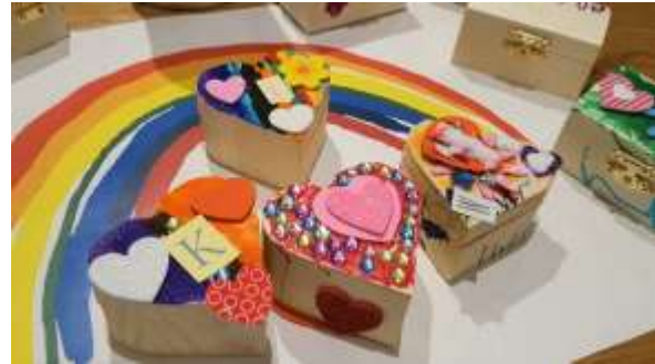
Figure 5 Example of Easter activities

Easter Activity sessions (Figure 5) have been held for children on Good Friday, followed by a Stations of the Cross service involving parents. Christmas Activity sessions are held before the Christingle service, when the children make wonderful decorations for the church, while the adults are busy making over 50 Christingles!