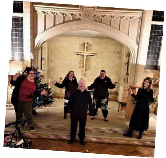
Figure 3 Members of Sunday Club at a Breathe Deep event and the Sunday Club Leaders

We strive to ensure that our churches provide an inclusive, safe and welcoming environment with a variety of activities and worship to suit all ages, mainly at St Aidan's.