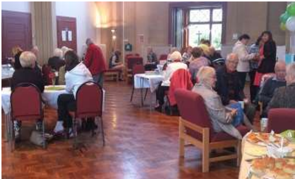
Figure 10 Photos of some of the events held in the Parish.