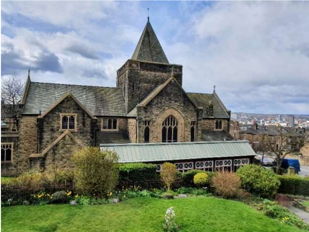
Figure 11 St Aidan's Church