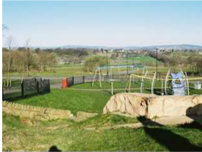
Figure 2 View across Manor Fields

The area is well served by schools, medical centres, dental surgeries, shopping areas, community resources (nursery, training centre, advice centres etc) and open space (Figure 2). Excellent public transport provided by frequent bus services to all areas and Supertram runs along City Road at Manor Top providing links to Crystal Peaks, Sheffield city centre, Meadowhall and Rotherham.