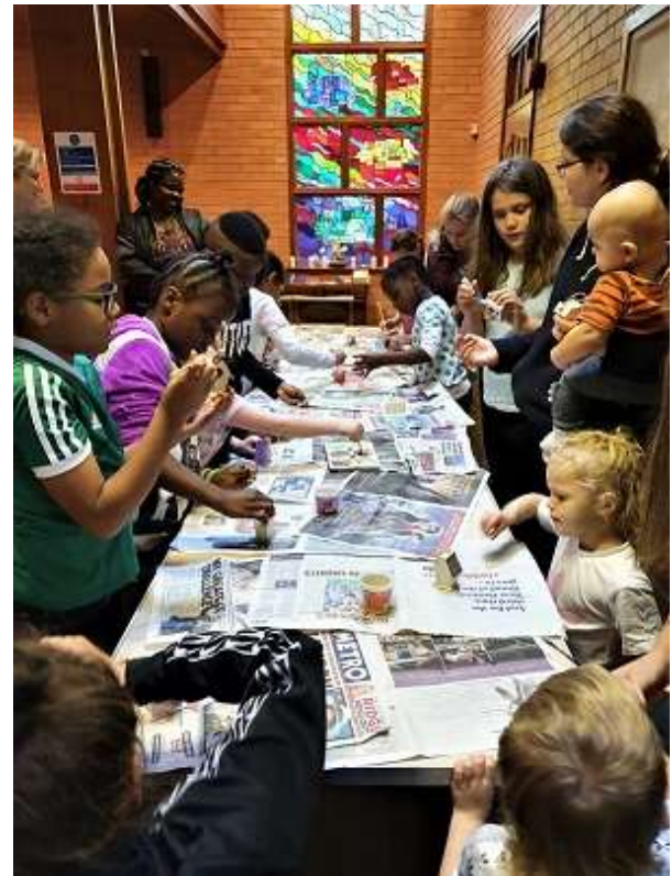
Figure 4 Family Church at St Swithun's Church

Family Church (Figure 4) attracted local young families and children to spend an hour or so