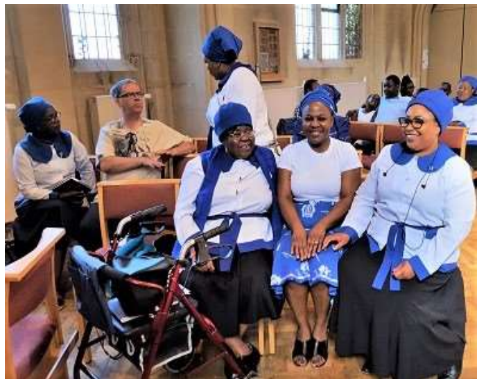
Figure 8 Members of the Shona congregation

Members of our Shona congregation often provide us with their uplifting sound of joy on special occasions (Figure 8). Scouts' services and major festivals have meant that young people and their families have joined in familiar and newer songs.